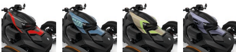
Diablo Red Blue Abyss Goblin Green Purple Galaxy