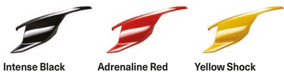
Intense Black Adrenaline Red Yellow Shock