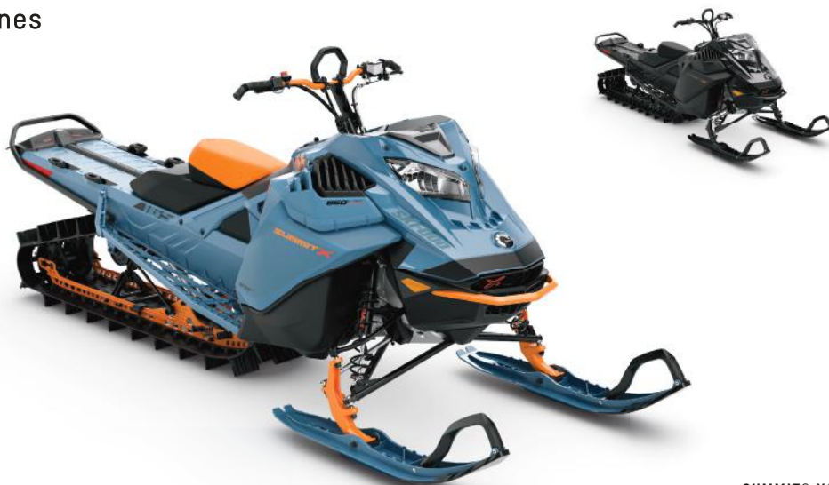
SUMMIT® X® 165 850 E-TEC® TURBO SHOWN

Longer climbs, tighter tree lines and deeper powder.