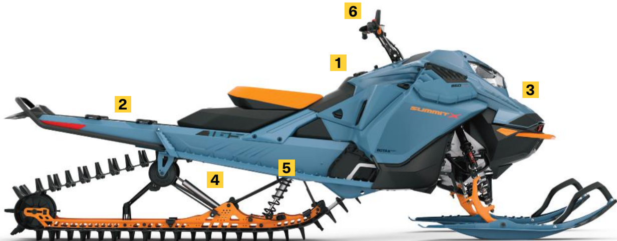
SUMMIT® X® 165 850 E-TEC® TURBO SHOWN

One-piece polypropylene construction instantly drops 6.2 lb of weight. Optimized ventilation for heat dispersion and noise reduction.