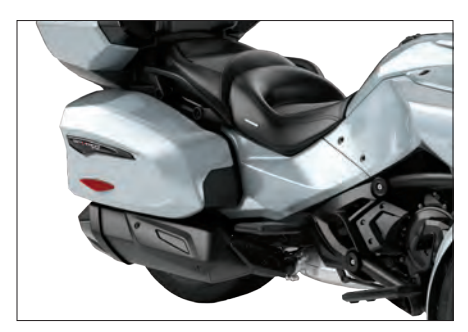
SELF-LEVELING AIR SUSPENSION

Watertight top case provides 15 gal (60 L) of storage, making it perfect for not leaving anything behind on a long distances ride.