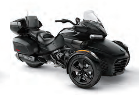
MONOLITH BLACK SATIN