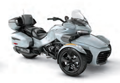
GLACIAL BLUE METALLIC DARK*